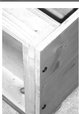
Fig. 3 Panel Foot Top Assembly