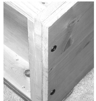
Fig.5 Base Assy.

Lay the headboard panel on the bolts between the sides, with the finished face to the mattress and the rounded edge toward the cabinet top. Attach the panel at each end by lifting the end, retracting the bolts, letting the end down in position, and starting the bolts in to the panel ends. When all bolts are started, tighten firmly with the Allen wrench.